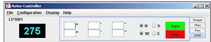
DEGREES, MINUTES, SECONDS

The DRC 3 is mounted at the antenna tower. A shielded pair of wires is run from the DRC 3 into the radio control building to the modem we supply for your Windows/Vista based computer. There is no separate inside control box.