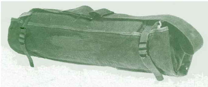
I910AA PACK BAG